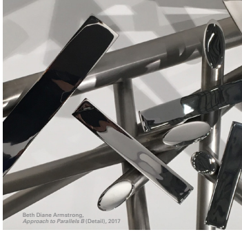
Beth Diane Armstrong, Approach to Parallela B (Detail), 2017

Standard Bank Young Artist to 2017: Beth Diane Armstrong's sculptural and installation projects are currently on display at the Oliewenhuis Art Museum. The exhibition highlights Armstrong's use of sculpture to explore different expressions of these two terms in relation to scale, structure, materials, space, representation and process. This body of work includes a series of large-scale sculptures that explore the human form in a new and unexpected way. Armstrong's work was first exhibited in 2009.