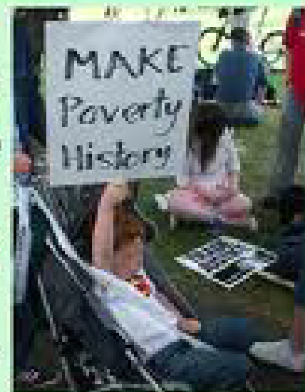
Make Poverty History

Never accept statistics about global poverty at face value and always remember that each household behind the figures has its own human story to tell. Whatever the difference of opinion on the extent of global poverty, one thing is certain: a significant proportion of the world's population is excluded from our prevailing economic system of wealth creation. The symptoms of its inherent instability – recession, volatile food and fuel prices, and climate change - impact disproportionately on the poor.