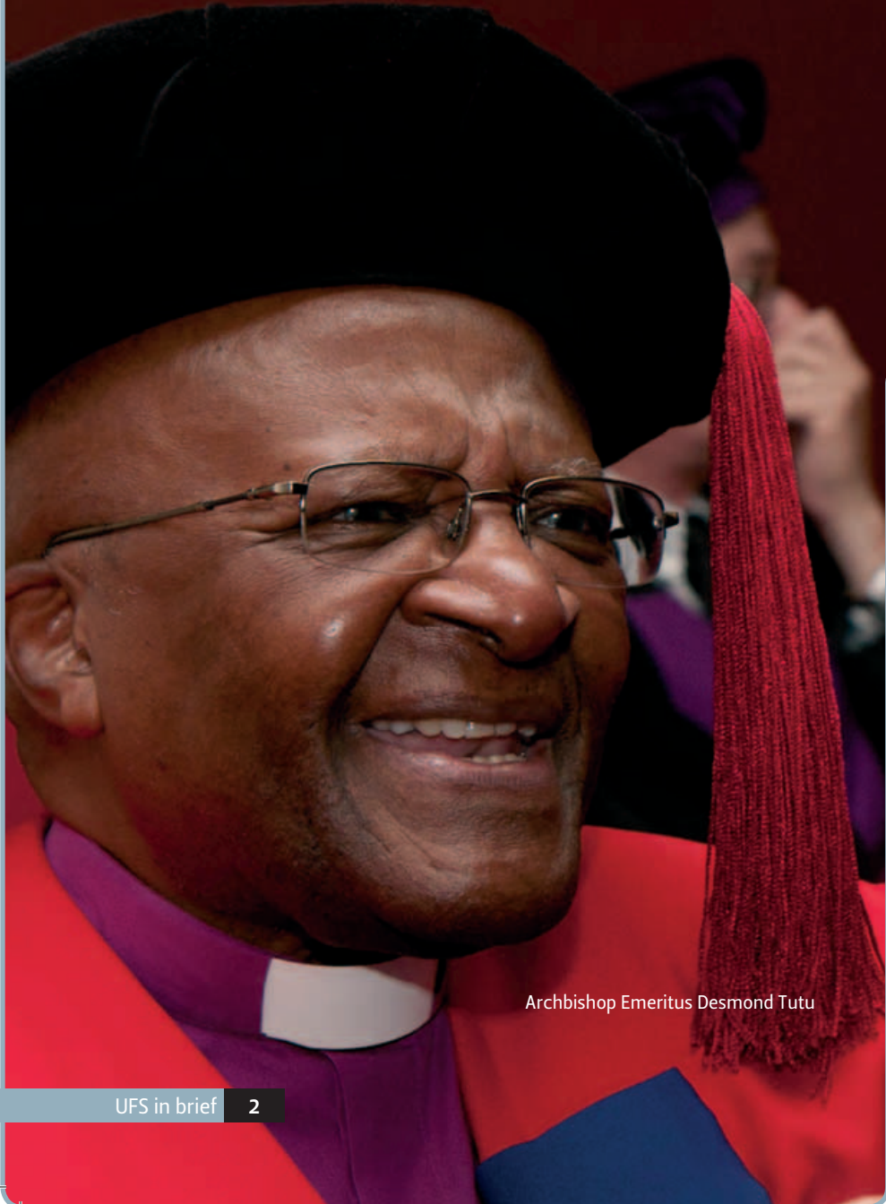
Archbishop Emeritus Desmond Tutu