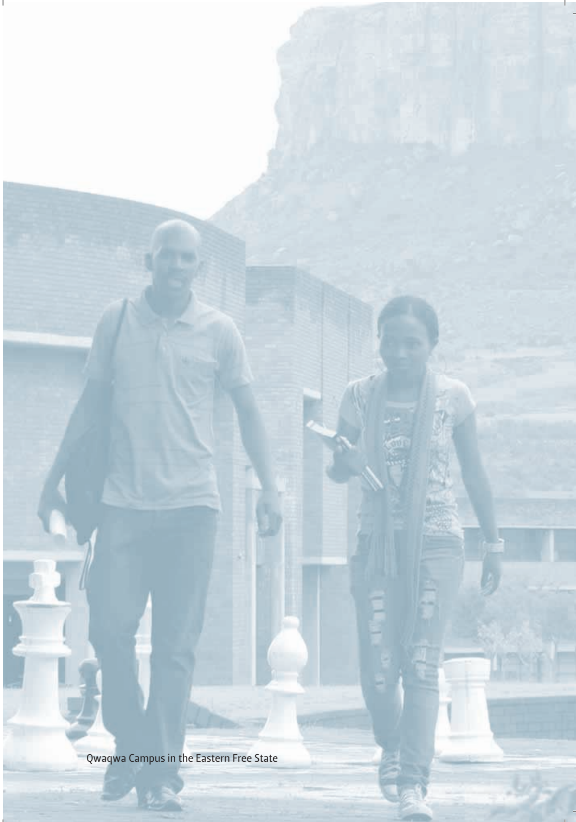
Qwaqwa Campus in the Eastern Free State